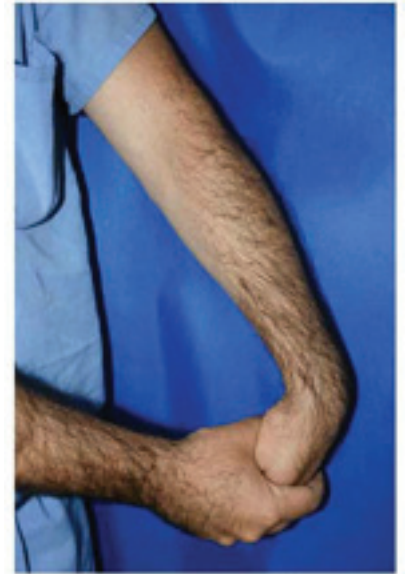
Wrist stretching exercise with elbow extended.