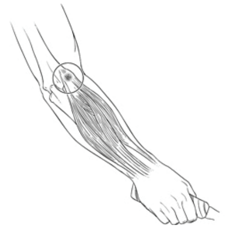
Location of pain in lateral epicondylitis.

Your doctor will talk to you about what activities cause symptoms and where on your arm the symptoms occur. Be sure to tell your doctor if you have ever injured your elbow. If you have a history of rheumatoid arthritis or nerve disease, tell your doctor.